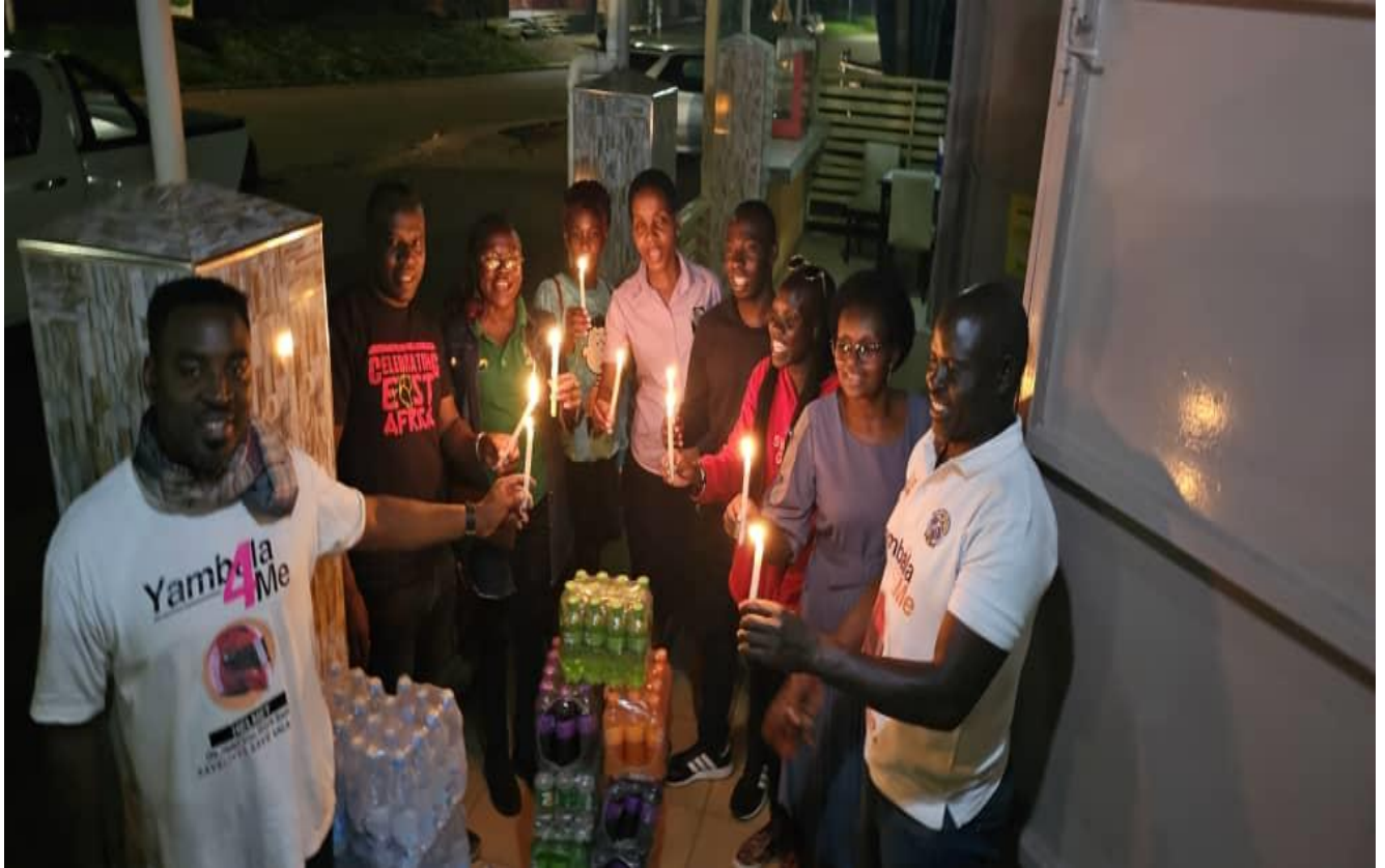
Pre-Candle Light Memorial support to the PLHIV Camp Fire with support from Kinyara Sugar Masindi