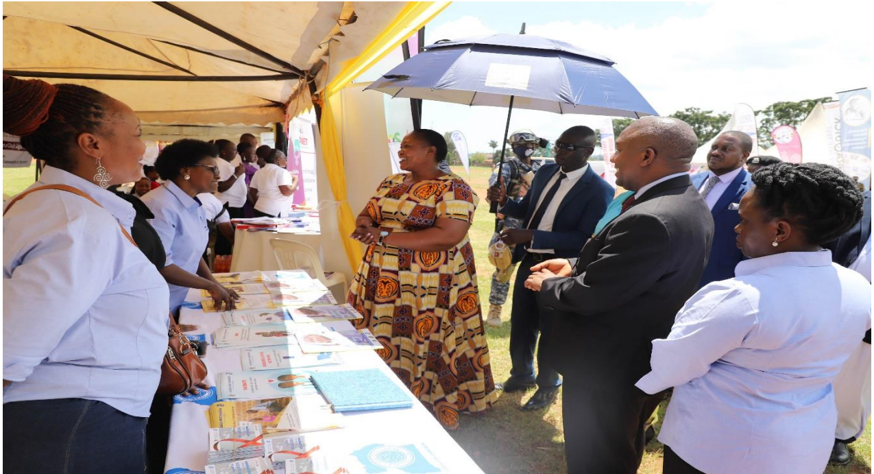
The Minister in charge of the Presidency, Rt. Hon. Milly Babirye Babalanda visiting a stall organized by Uganda AIDS Commission during the Candlelight Memorial Day Commemoration at Boma Grounds, Hoima City.

HIV counselling and testing, condom distribution on going at Kiryatete Bad Street and at Hoima City Market cell.