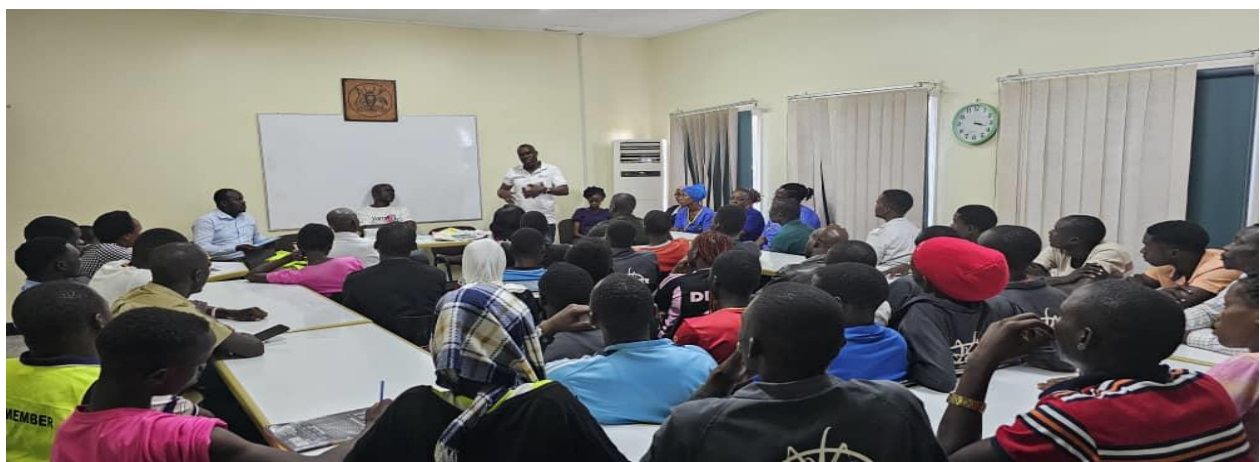
HIV awareness campaign at Kinyara Sugar factory with workers. Such interventions are needed to improve the knowledge of workers in HIV awareness