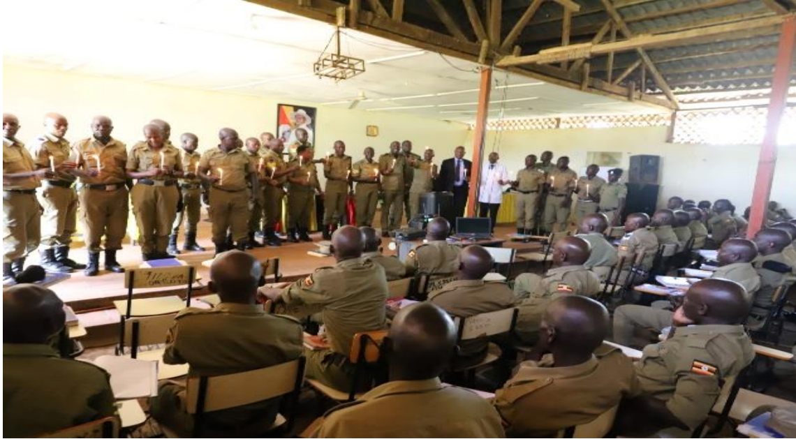
Police engagement in Masindi during the pre Candle Light Commemoration at Kabalye Training School. Engagement and dissemination of HIV messages is key in ending AIDS by 2030