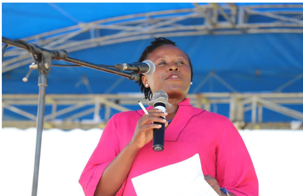
UN resident Country Coordinator delivering the message to the participants, she called upon the country to embrace programmes that impact the Adolescents Girls and enrollment of young people in schools