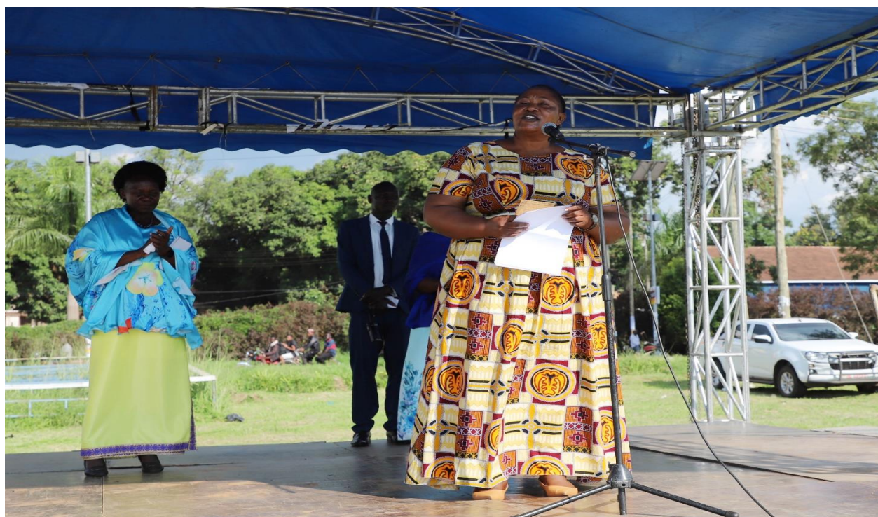
Chief Guest Hon. Milly Babalanda Babirye, Minister for the Presidency delivering the speech on behalf of the Rt. Hon Prime Minister during the Candle Light Commemoration in Hoima Boma grounds in Hoima City on 17th May 2024

The Hon Minister for the Presidency on behalf of the Rt. Hon. Prime Minister appreciated the opportunity to officiate at the important occasion marking the International Candle Light Commemoration event which happens globally on 3 rd Sunday in May every year. As a Country, Uganda joined the rest of the world to commemorate this candle light day, with the theme of: Ending AIDS by 2030: Keeping Communities at the Center. In her speech she noted: