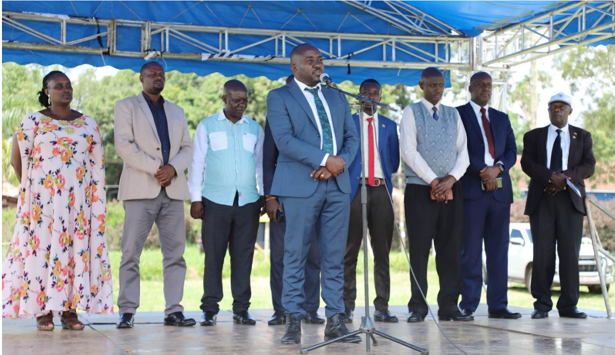
RCC Banduri making the remarks on behalf of the RDCs in the mobilization and monitoring of the HIV interventions across the country