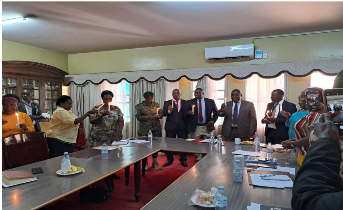
HIV Focal Point Persons from Government MDAs commemorating the Candle Light event in Office of the President

During the Candle Light preparation and commemorations, different Ministries, Departments and Agencies (MDAs) commemorated the CLM event within their offices and others participated at the National event in the Hoima. The MDAs that commemorated were Office of the Presidency, Uganda Registration Bureau, URA, Uganda Police, Uganda Peoples Defense Forces, State House, Uganda National Road Authority, Petroleum Authority, Uganda National Oil Company, Ministry of Water and Environment, Ethics and Integrity among others. During the commemoration event, health services were offered to general staff and those who found positive were linked for further care.