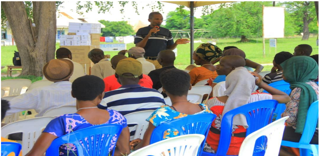
UNOC conducting the HIV awareness with the communities in Bulisa District, HIV awareness focusing on ABC approach by stakeholders will help to improve the HIV information to reduce the HIV infections among the communities