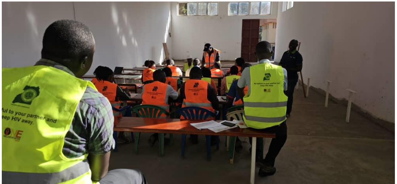
Engaging men at the place of work by Private Sector Secretariat in Bwendwero Dairy Farm Limited in Hoima