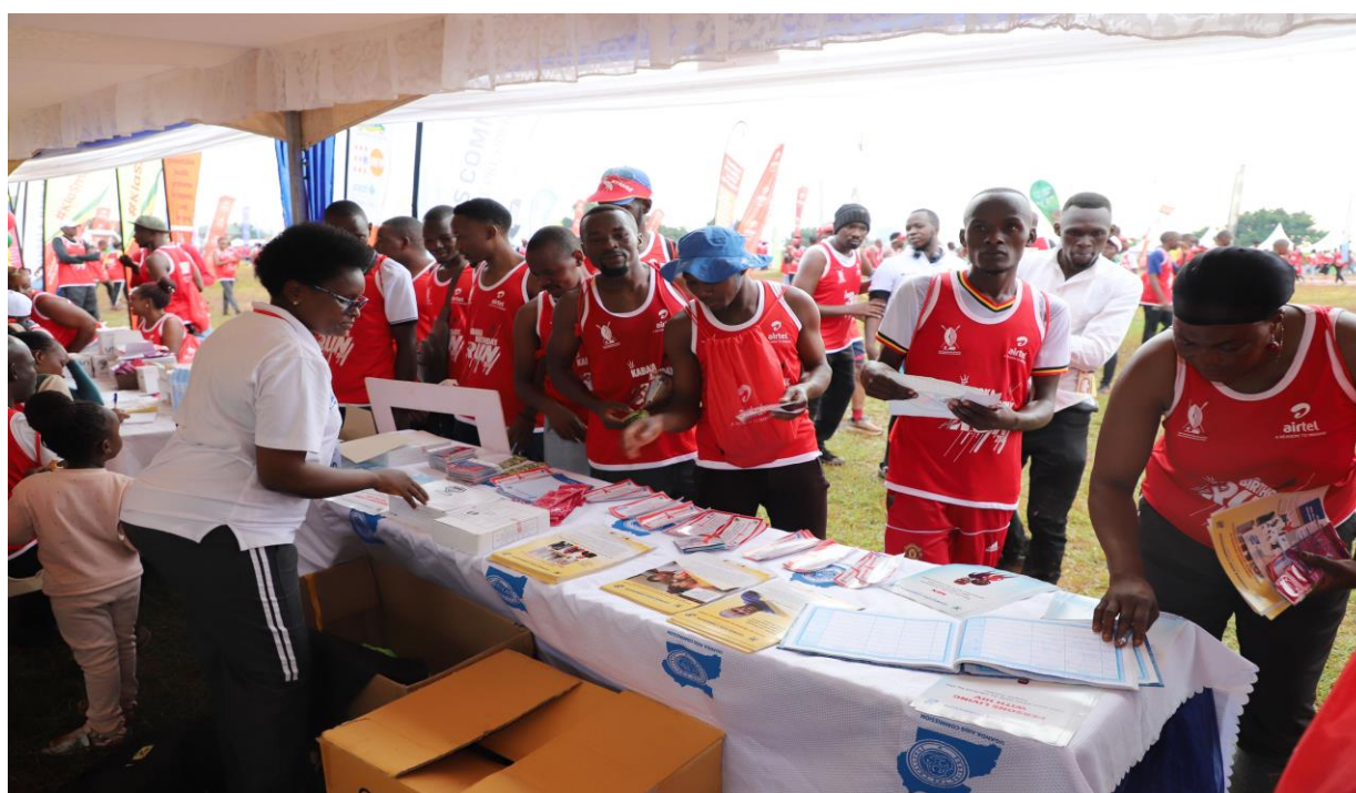
Dissemination of HIV prevention messages using IEC materials during the Kabaka birthday run Lubiri Mengo 7 th April 2024 where over 1 million were reached with the messages