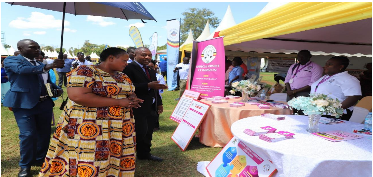
Minister in Charge of Presidency at Judicial Service Commission Exhibition Stall in Hoima. These exhibitions demonstrated the progress and work done by the stakeholders in the disseminating the HIV information and economic empowerment