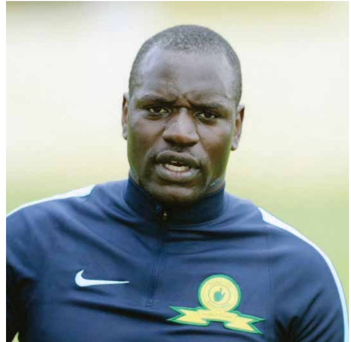
Denis Onyango, Star International footballer

Remember, as a man, you can only achieve your dreams if you are alive.