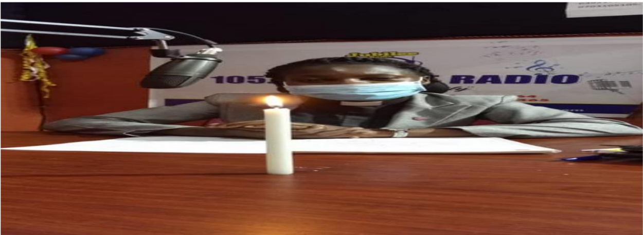
Religious leaders lighting the candle during the Commemoration prayers and radio talk shows