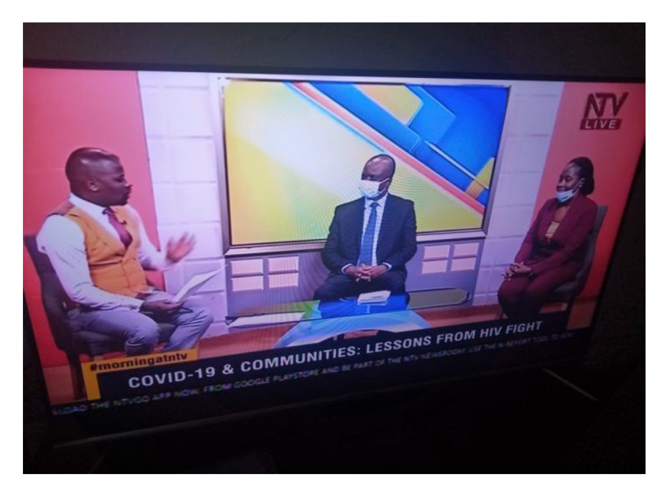
The Director General Uganda AIDS Commission together with the Embassy of Ireland HIV Advisor on a Talk Show hosted by NTV discussed the Candlelight Memorial and innovations in responding to the COVID-19 pandemic

UNAIDS and the Embassy of Ireland actively participated in the commemoration of the CL on behalf of the AIDS Development Partners Group. UNAIDS participated in the development of messages and sharing them out using various channels. The UNAIDS Country Director also participated on the panel on the commemoration day and in the talk show on UBC Tv. While the HIV Advisor to the Embassy of Irelands appeared on NTV morning Talk Show with the DG UAC to wrap up the CL commemoration. The topic for discussion was 'Communities and HIV; lessons for COVID-19.