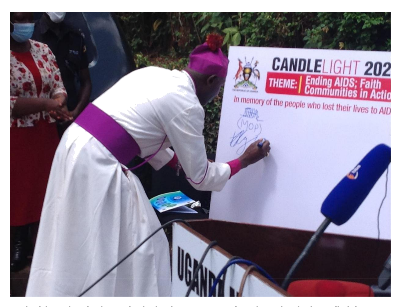
Arch Bishop Church of Uganda signing in commemoration of people who have died due to AIDS in Uganda