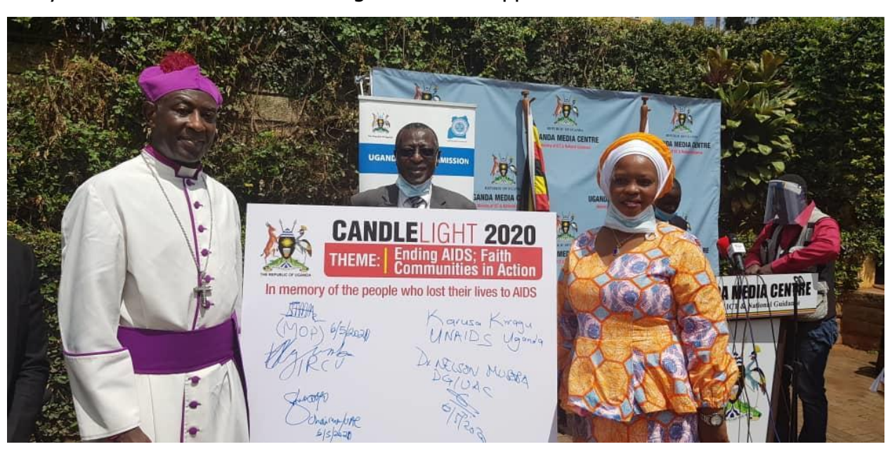
Chairperson Committee of Parliament on HIV and other related matters during the press briefing with Arch Bishop Church of Uganda and National Chairperson of PLHIV

Members of the HIV Committee of Parliament and other committee members participated in the commemoration of the CL. Some members went to radio stations and encouraged the communities to prevent HIV infections especially during the national lockdown due to COVID-19pandemic. Engagement of national leaders to reach the communities with accurate HIV information has promoted HIV awareness. Among the key recommendations, Parliament will provide oversight in the country to assess the effects of COVID on HIV interventions and PLHIV in the Country and provide critical analysis and recommendations for government support.